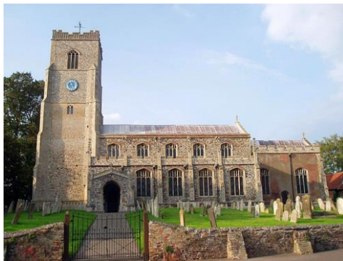
Church of St Martin's Fincham